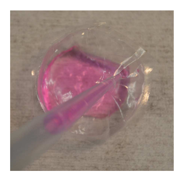
Figure S-1. Filling a bubble with a diameter 2.5 cm with an aqueous solution of rhodamine B using a plastic pipette tip.